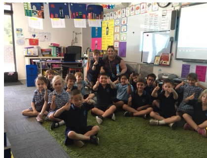
Year 6 making use of the weather...

Our year six students are off to Wilsons Promontory on Monday for the week. They will be camping, hiking and engaged in lots of great outdoor experiences including walking up Mt Oberon. We hope they have wonderful weather and are sure that they will have a great time.